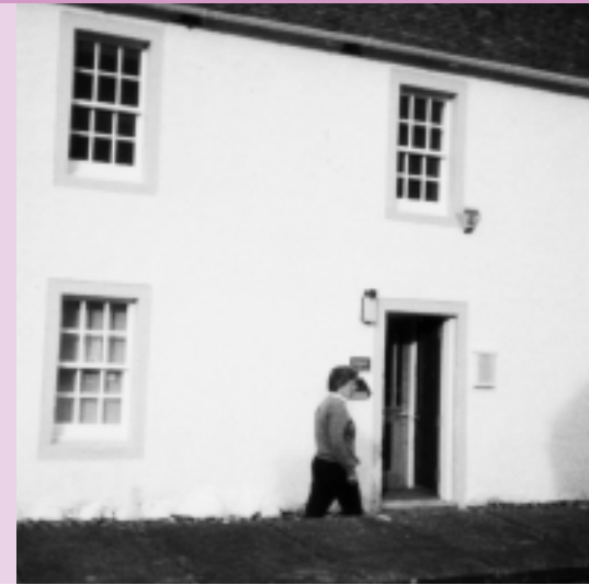
Groam House Museum

You may be offering entertainment through the telling of a story or you could be acting as an orientation centre, introducing people to a place or area.