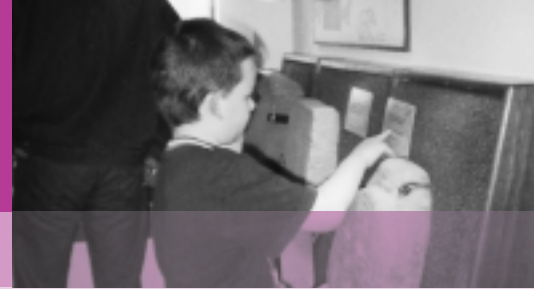
Groam House Museum

your own expertise, academic research. The techniques for interpreting a collection are many and varied; labelling objects, written guides, guided tours, virtual tours via a website, computer interactives, interpretation boards, live interpretation, artworks, drama.