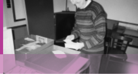
West Linton Historical Association

An archive is a collection of documents, photographs, maps and plans collected for preservation for future reference. This can be offered as a resource for research with provision for access and study.