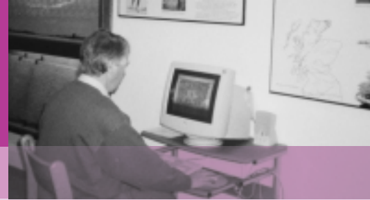
Groam House Museum

Any new heritage project must plan to use information technology. IT may be the solution for your project or it may be one of many tools you can use to deliver your project.