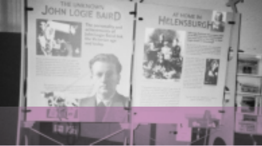
Helensburgh Heritage Trust

The rural location of the museum and the small size of the local communities also mean that development programmes and funds are not always forthcoming. The Kilmartin House response to this lack of revenue funding is to aim for financial sustainability through developing the Trading company and its activities outside Kilmartin House. Financial independence for Kilmartin House looks like one of the best ways to financial stability.