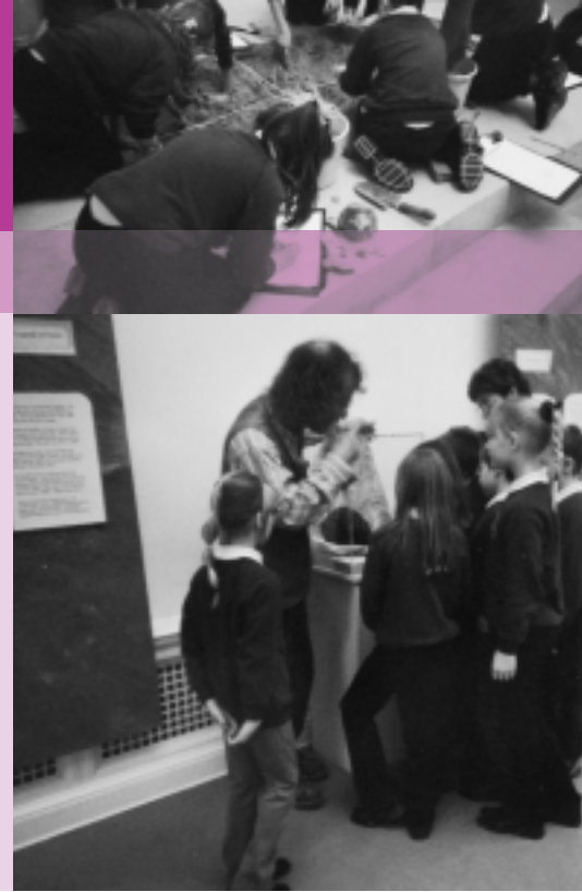
Scottish Borders Council Museum Service

The service you can provide will be enhanced the more you involve others who already have educational experience, for example your local Primary Adviser or Community Education staff.