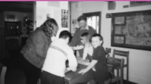
Groam House Museum

In this section, we give an explanation of each of the choices listed in section 3, before going on to outline the implications attached to each, which in turn should influence the decisions you make when developing your project. The choices you make now will have implications for the future. It is important to think through the consequences before planning your project.