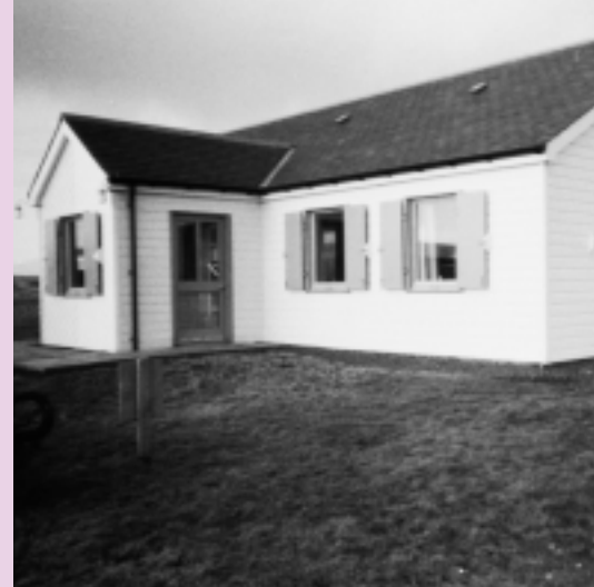
Top: Dollar Museum