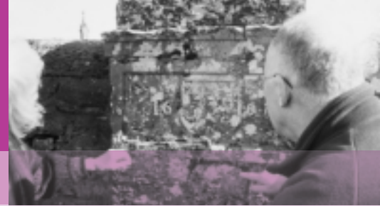
West Linton Historical Association

Oral history recording has become increasingly popular as a way of ensuring that individual experiences, opinions, stories, language and accents are collected and preserved.