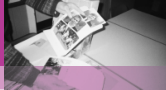
West Linton Historical Association

Today, with a booming interest in family history throughout the world, coupled with the ease of global communication via the internet and affordable air travel, it is perhaps not surprising that 'roots-tourism' has become something of a mass movement. Even in a small crofting and fishing community such as Dunbeath, throughout the summer months barely a week goes by without at least one overseas visitor arriving at the Heritage Centre and announcing that he or she has ancestral connections to the place. Such pronouncements are met with a flurry of activity as box files, photographs, maps and family tree charts are produced and, over a cup of tea or two, information is exchanged and excursions to long-deserted settlements arranged.