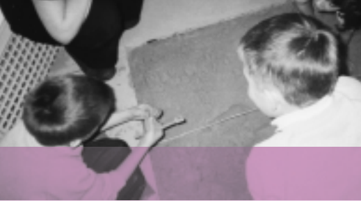
Scottish Borders Council Museum Service